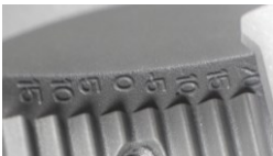
ADJUSTABLE ANGLE: FROM -20 ° TO +15 ° IN THE STEP OF 2.5 °