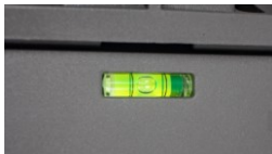
WATER BUBBLE BALANCE