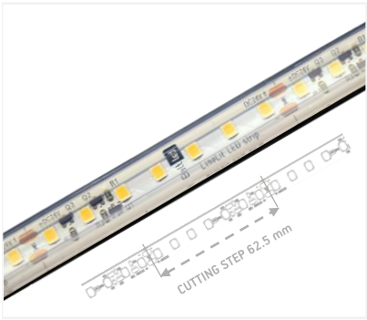
IP 67 | 112 LEDs